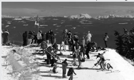
The "Velocity Challenge"