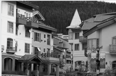
Sun Peaks Village