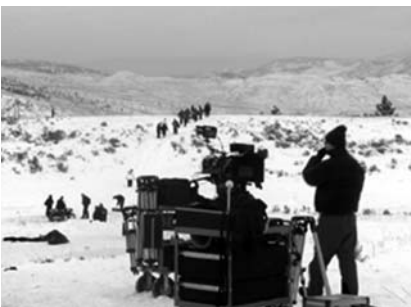
Augusta, Gone Partially filmed in Kamloops area

Trig's Mini Storage 408 Merritt-Spences Bridge Hwy #8 Lower Nicola tel 378-4669