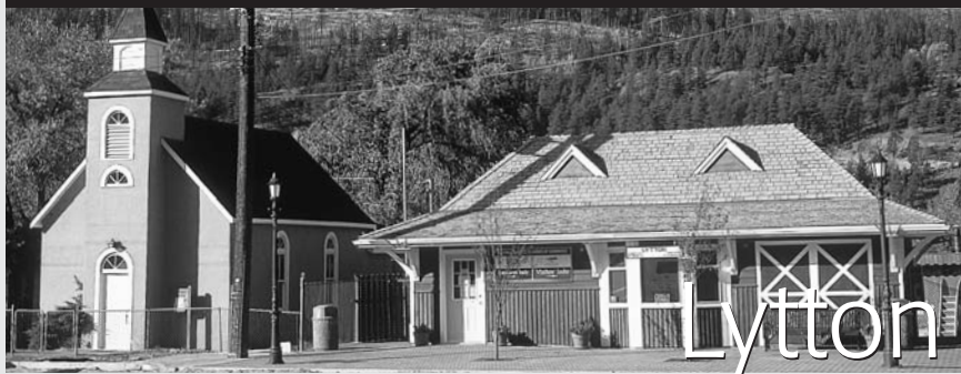
Includes Spences Bridge