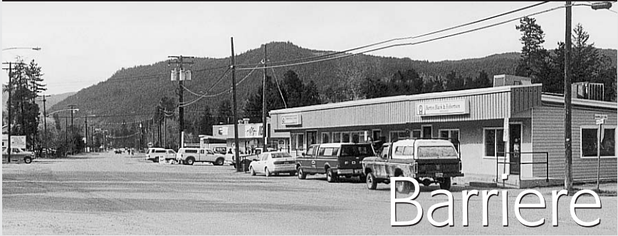
Includes Darfield, Louis Creek and McLure