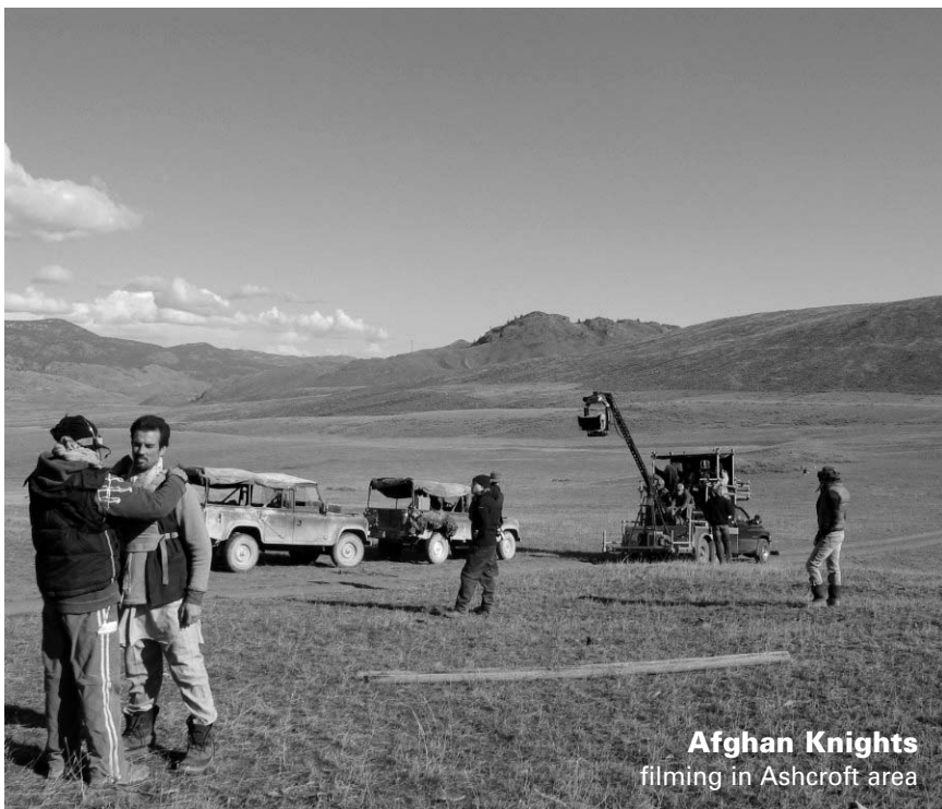
Afghan Knights filming in Ashcroft area